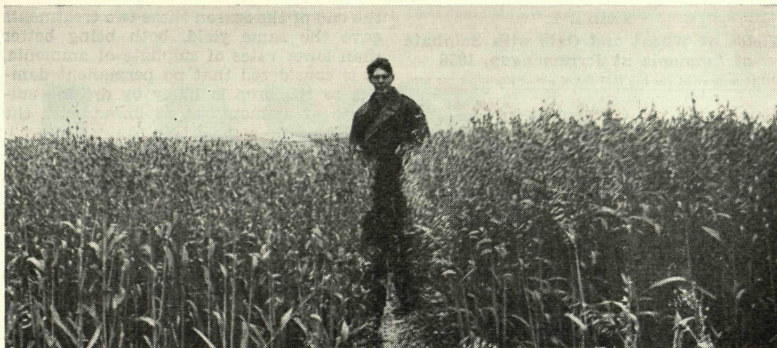
Gairdner River. Experiment 1, 1958. The plot at left received no sulphate of ammonia. That on the right received 112 lb./ac. Note the denser stand. The grain yields were 29 bush./ac. and 45 bush./ac. respectively.