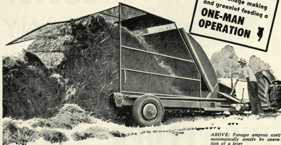
ABOVE: Forager empties itself automatically simply by operation of a lever

makes silage making and greenlot feeding a ONE-MAN OPERATION