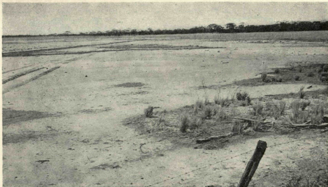
Severely salt-affected country underlain by a shallow saline water-table