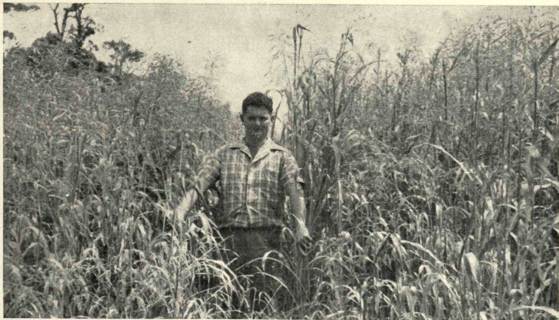
The Sudan grass plots described in the article. This photograph taken on January 28, 1957, shows W.A. Commercial strain on right and S.S.6 (sweet variety) on left.