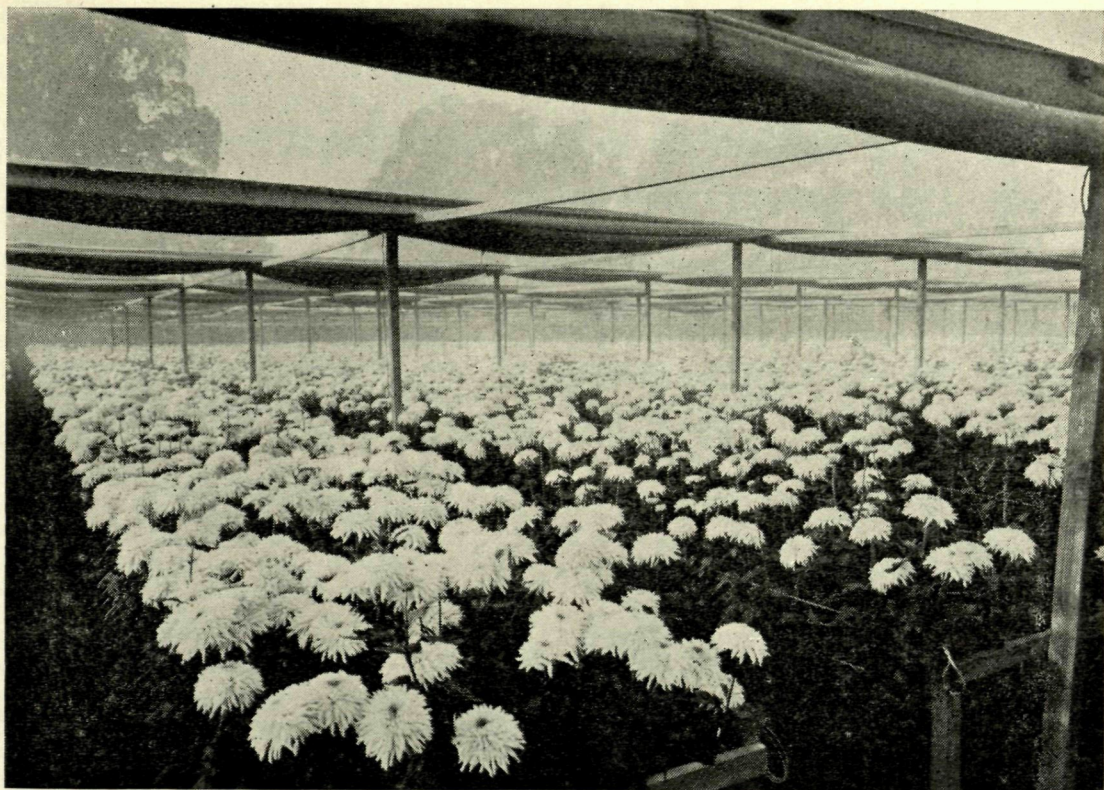
Fig. 2.—A late crop of outdoor chrysanthemums in England, showing method of supporting plants by wires and strings, also the hessian protection against frost, wind and rain