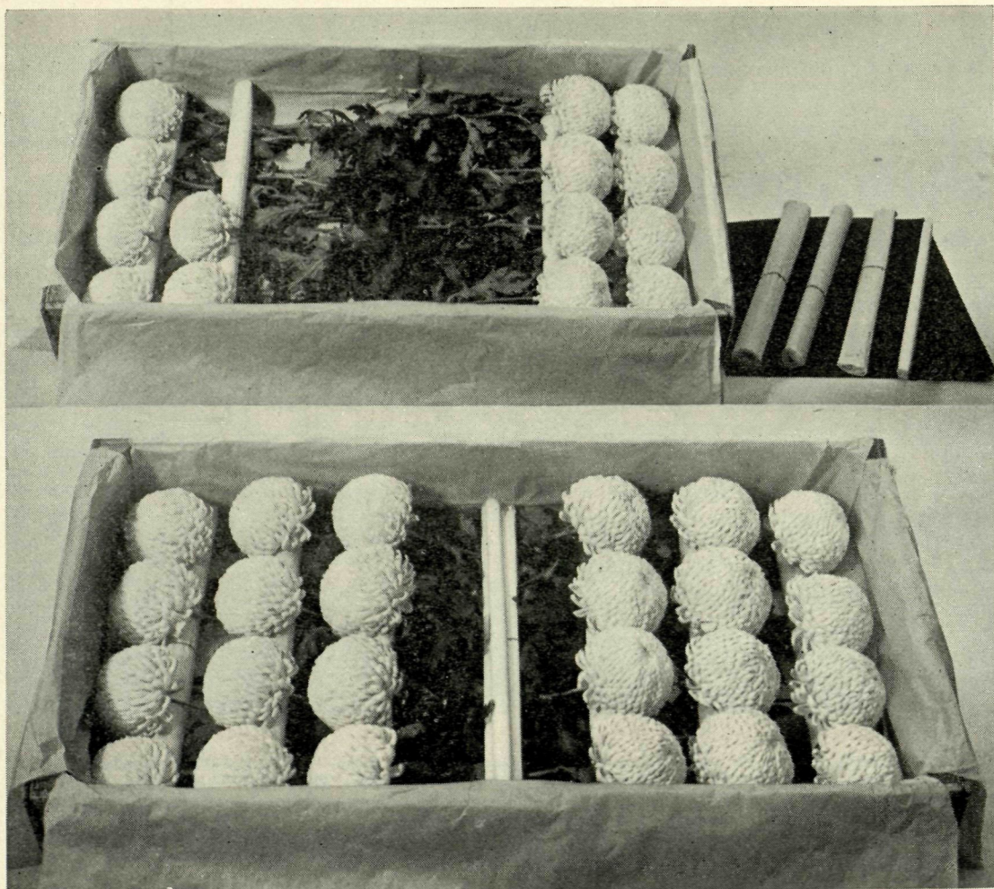
Fig. 3.—Chrysanthemums packed for market, showing method used in England. They are packed in returnable wooden boxes with the individual blooms supported by cushions and held in position by a dowel fixed across the centre of the box