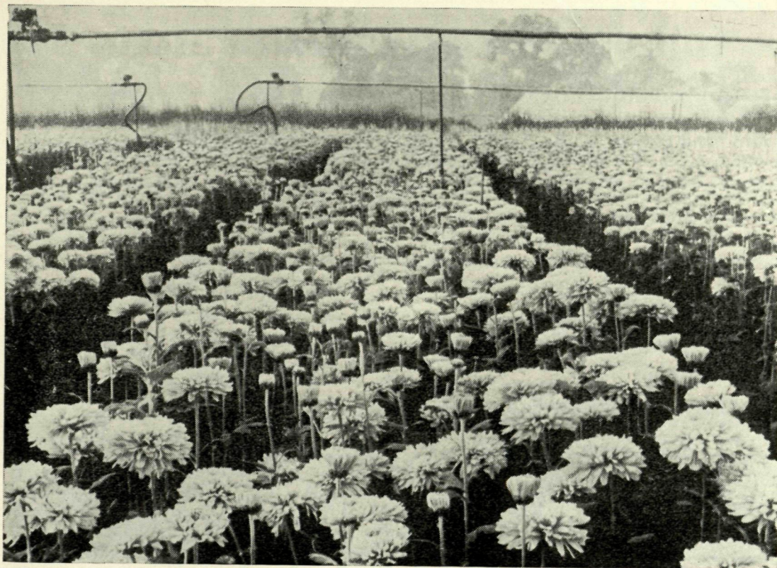
Fig. 1.—A crop of early-flowering chrysanthemums showing method of growing in wide beds, and the system of watering from overhead oscillating spray lines. The variety here is Sweetheart, which commences flowering at the end of July