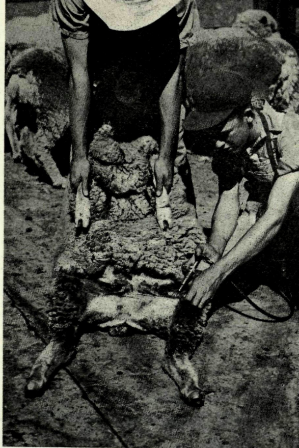
Fig. 1.—Using an automatic vaccinator to inoculate a sheep with entero-toxaemia vaccine

The ability of vaccines to stimulate the formation of antibodies is variable. With products like botulinus toxoid and tetanus toxoid, it is of a high order, whereas with