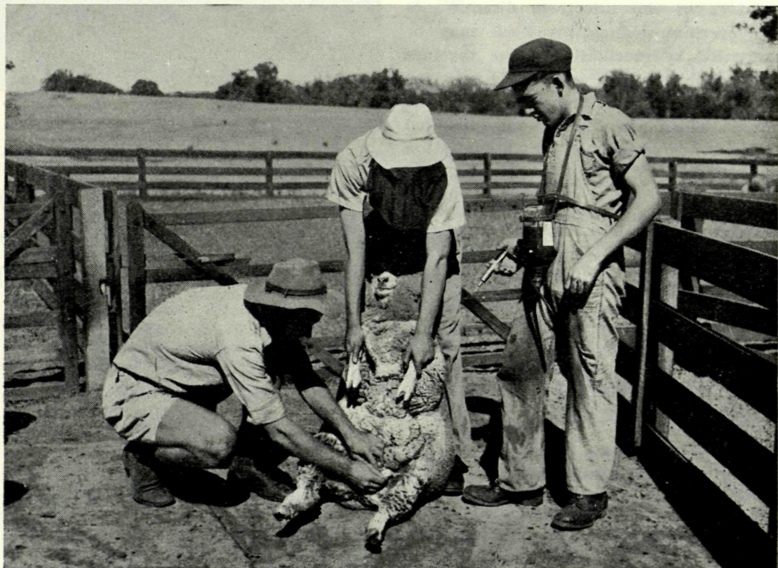
Fig. 2.—A vaccination team at work. One man holds the sheep, another swabs the site of the injection with methylated spirits, while the third operates the automatic vaccinator

For preference, sheep should be inoculated in the shearing shed, since this will reduce the risk of contamination by dust to a minimum. In