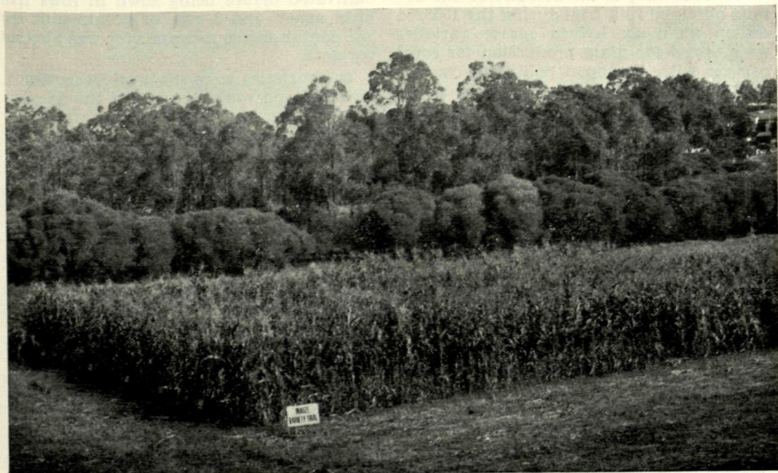
Fig. 1.—General view of the experimental maize plots at Denmark Research Station.

greatly from year to year according to the amount of summer rainfall received and also to the moisture supplies available from the soil. In 1950-51 the summer rainfall season was good and extremely high yields ranging from the equivalent of 90 to 194 bushels to the acre were obtained in small row trials. The mean yield of a number of varieties in that year was equivalent to 148 bushels to the acre. The general level of yields throughout the years has been much lower than this with means