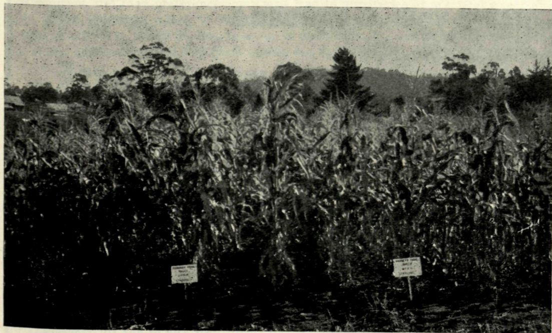
Fig. 3.—Tall-growing variety Standfast (3 rows) on left and Sterling (NEH16) on right.

For grain production, Hickory King maize is considered to be somewhat late for most areas in this State as when the grain is ripening autumn rains commence, and provide conditions suitable for the development of moulds in the cobs. For this rea-