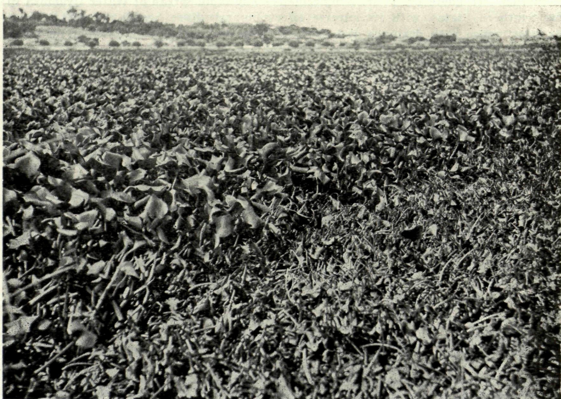
Water Hyacinth growing on Lake Monger. The plants in the right foreground show the effects of a recent spraying with 2,4-D. The weed has now been eradicated from Lake Monger.

Although Water Hyacinth is not a weed of crops or pastures it has a number of undesirable features, several of which are of significance to agriculture. Important waterways in many countries have been made unfit for navigation thus eliminating an economical form of transport. Irriga-