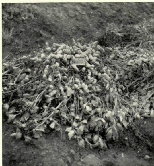
Fig. 3.—The size of this plant may be estimated by the matchbox in the centre.

The peanut ( Arachis hypogaea ) is a legume, and is therefore capable of forming a "symbiotic" relationship with certain species of bacteria which take up atmospheric nitrogen for use in their own body processes. These bacteria, attached to the roots of the plant, then "exchange" nitrogen products for carbohydrates formed by the plant so that each member benefits. When such bacteria are active, nodules form on the roots of the host, and these, when broken, show a pink colour internally. Under certain conditions excess nitrogen products are liberated into the soil. The peanut plant itself is of a