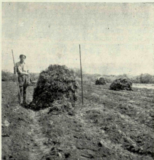
Fig. 1.—Mr. Smeed standing beside one of the 68 stooks of nuts harvested from just under two acres.

In the irrigation trial, Method 1 gave the best results, since the gradual forming of a ridge gives better lateral pene-