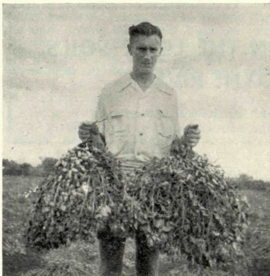
Fig. 2.—Two average plants of peanuts selected at random.

tration of the water and leaves the soil in a friable condition more suitable for "pegging".