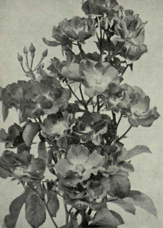
Fig. 2.—DE RUITER'S HERALD

A hybrid polyantha rose of great vigor. The single flowers in brilliant scarlet with orange shadings are borne in immense clusters