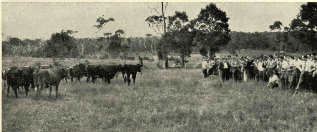
Fig. 1.—Farmers inspecting the dairy herd during a field day at the Bramley Research Station.

This is in addition to the present annual £250,000 Dairy Efficiency Grant.