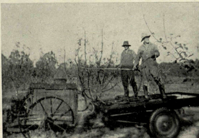
Fig. 1.—The home-made power sprayer used by Mr. J. L. Parke, which was used to such good effect. The tractor was driven along every alternate space between the rows of trees.

Before describing the actual spraying operation, it is well to state here that a