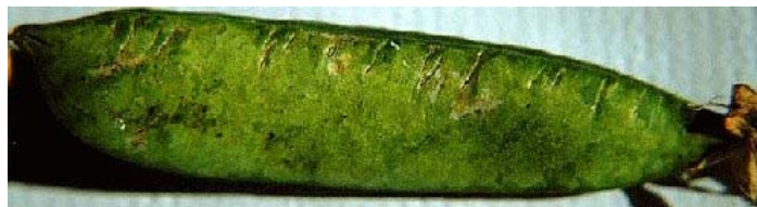
Blistering of pod