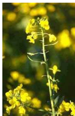
Canola plant showing various stages of pod loss and flower abortion.

Canola flowers for a 30-40 day period, allowing pod set to continue after a frost. Open flowers are most susceptible to frost damage, Pods and unopened buds usually escape. If seed moisture content is below 40 per cent when frost occurs oil quality will not be affected.