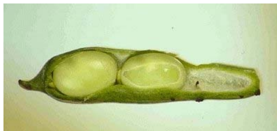
Missing faba bean seed