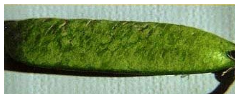
White mottling of pod