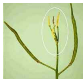
Yellow/green discoloration of pods.