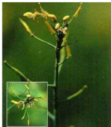
Aphids on canola flower stem.

It is important to remember that frost damage is quite random and sporadic, and not all plants (or parts of plants) will be affected, whilst most disease, nutrient and moisture related symptoms will follow soil type.