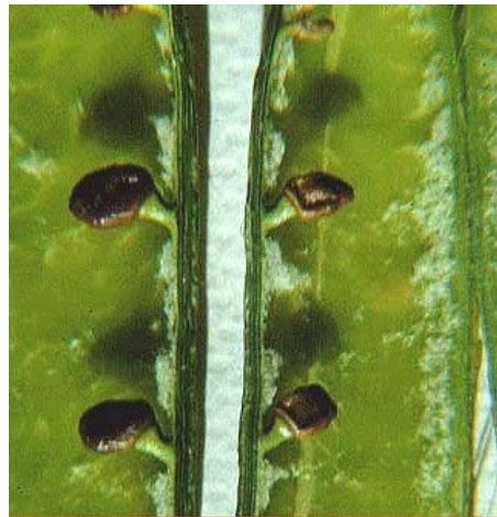
Seeds are killed and turn a brown/black colour.