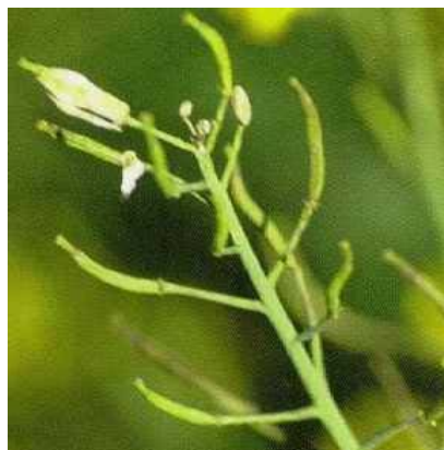
Sulphur deficiency and aphids. Flower petals retained and pods stunted and yellow/reddening.