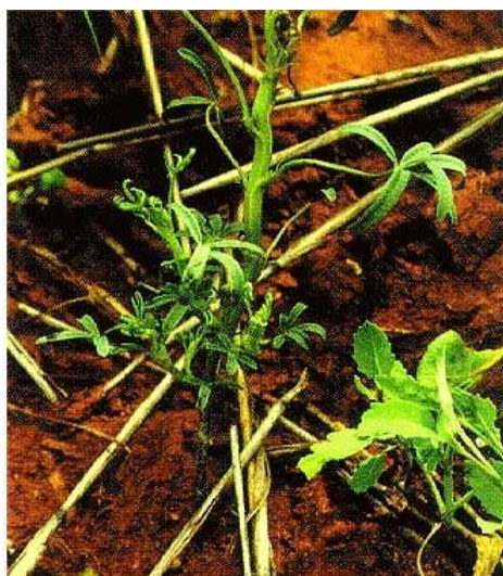
Herbicide damage in lupins.