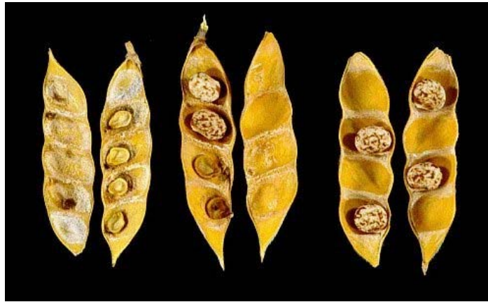
Shriveled seeds in the pod. Unaffected on right.