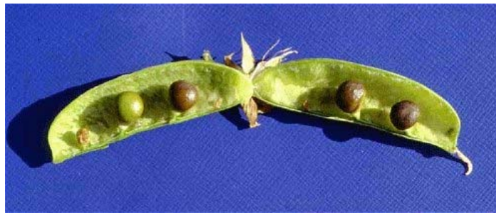
Seeds damaged by frost