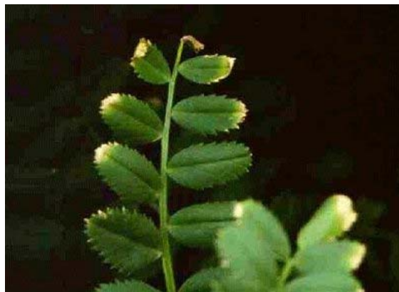
Bleached leaf margins.