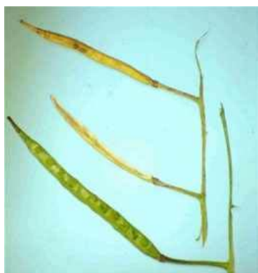
Yellow/green discoloration of pods at top. Healthy at the bottom.