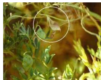
Pod killed by frost.