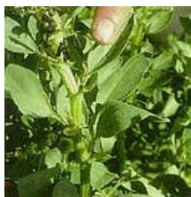
Remaining flower stalk