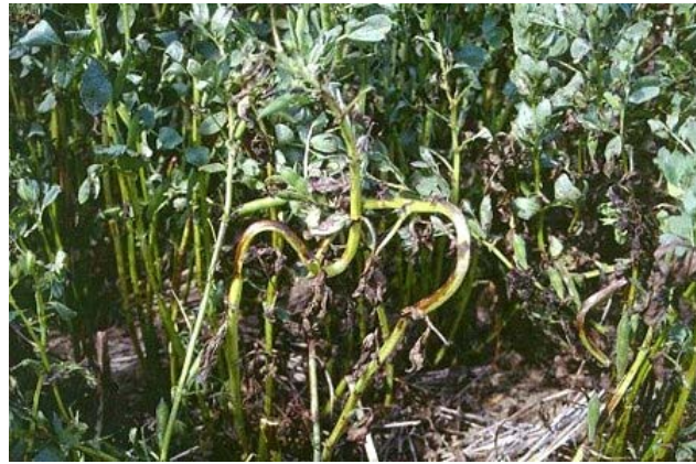
Distorted growing points lead to crookshank distortion and disease invasion