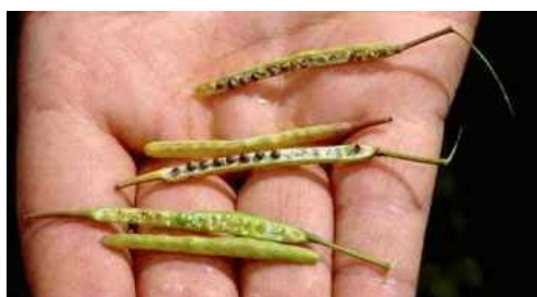
Missing and shriveled seeds.

Canola flowers for a 30-40 day period, allowing pod set to continue after a frost. Open flowers are most susceptible to frost damage, Pods and unopened buds usually escape. If seed moisture content is below 40 per cent when frost occurs oil quality will not be affected.