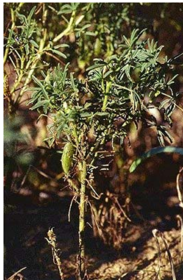
Scorched and withered leaves