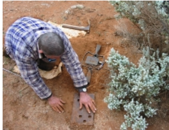
Dogger preparing trap site.

In some instances, particularly when wild dogs are operating within sheep paddocks, specialist trapping is required. A novice can be readily taught the basic mechanical skills of setting a trap, but needs to spend time with an experienced dogger to learn where to set traps and the type of sets that can be used. Incorrect placement of traps not only wastes time but also, more importantly, has the potential to create trap-shy dogs, which then often become a challenge for even the most experienced dogger.