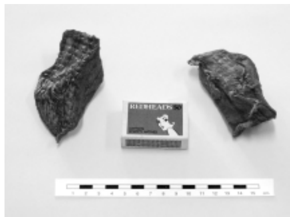
Well-prepared dried meat baits.

Despite the known effectiveness of the dried meat bait, there is some merit in having alternative bait materials. A salami type bait developed for foxes in Western Australia is expected to be tested for use against wild dogs. If it proves to be effective, the salami bait would be an additional bait, not necessarily replacing the field or factory-produced dried meat bait, and it too would be available from retailers. The salami baits would have a uniform size and weight, which means that they may be able to be aurally dropped via an automated delivery system. This would allow the navigator to have complete control of the bait-drop.