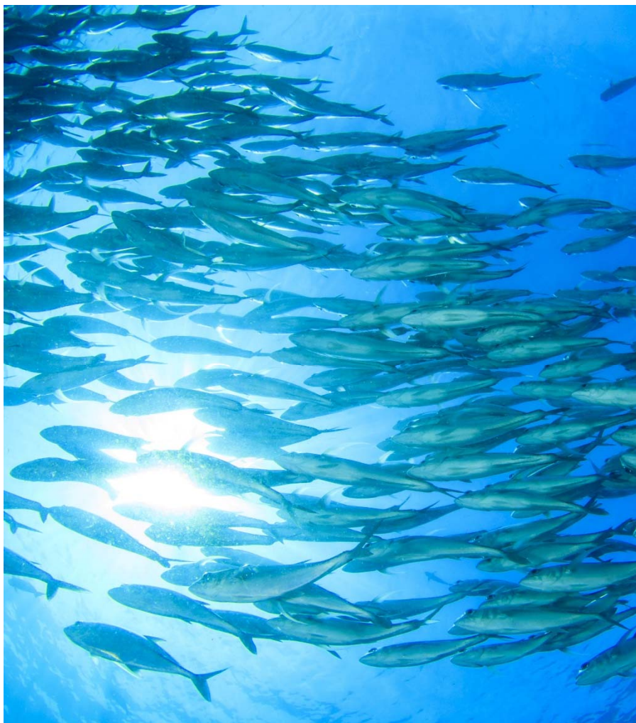
Image 2 – School of fish. Biosecurity is critical to WA's aquatic environments and fishing/pearling/aquaculture industries