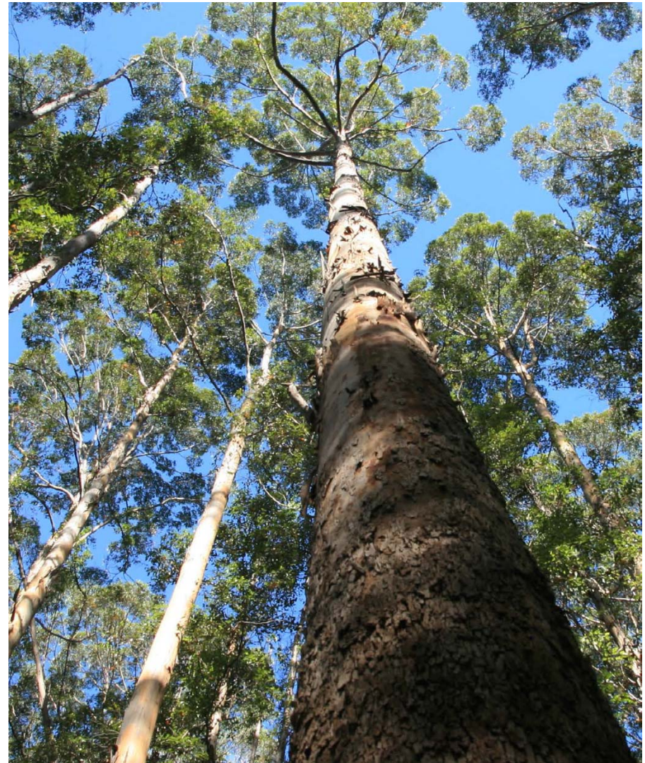
Image 3 – Biosecurity is critical to WA’s terrestrial environments and forestry industries