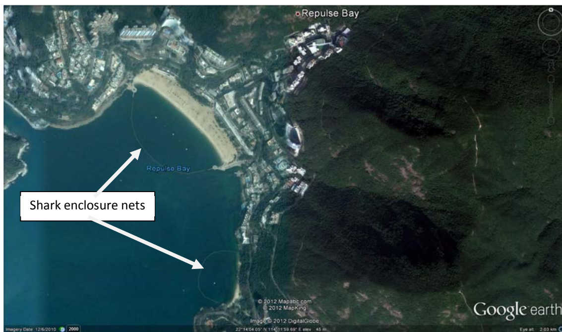
Figure 1 An example of shark exclusion nets in the Repulse Bay area of Hong Kong.

Methods to completely exclude sharks from an area have been employed in a number of locations. Shark exclusion nets are the principal methods of bather protection in Hong Kong since the early 1990s when a series of shark attacks resulted in six fatalities. The nets are in place nine months of the year at all gazetted beaches and there have been no fatalities since their installation. The Hong Kong nets are designed and engineered to withstand 10 metre waves. Beaches in the Hong Kong area are very short stretches of sand interspersed between large rocky headlands meaning that beach activities are restricted to a relatively small part of the coastline. An example of shark exclusion nets in Hong Kong are shown in Figure 1 and the relatively short length of beaches are also illustrated. An average net enclosure would be 500 m long and either semi-circular or rectangular in shape. They are diver-inspected a minimum of twice a week, and independent verification is required. They also exclude floating refuse, and clearly define the swimming area.