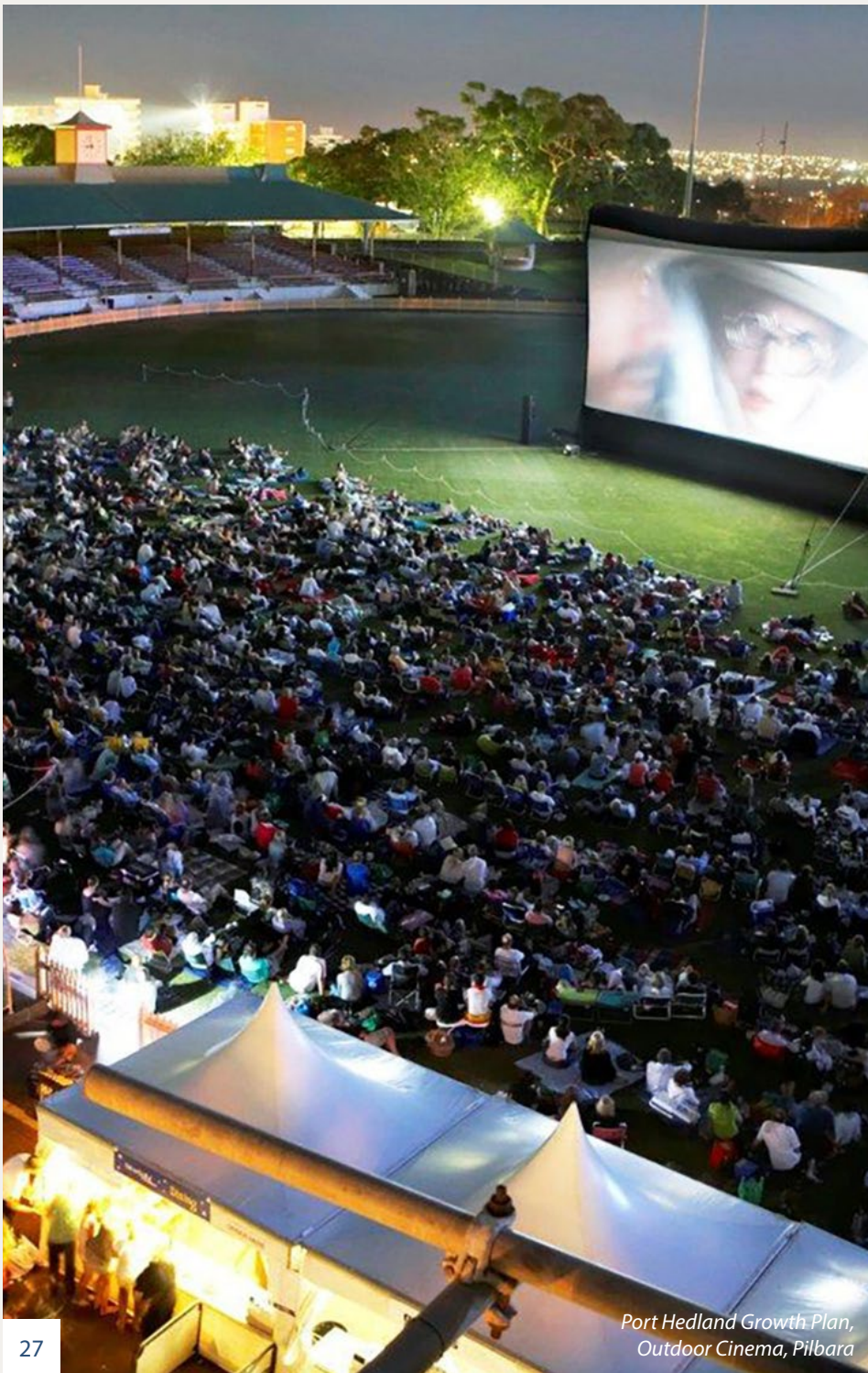
Port Hedland Growth Plan, Outdoor Cinema, Pilbara

On 24 July 2014, DRD's FOI Coordinator requested an extension until Friday 8 August 2014. On the 7 August 2014, the Trust provided a Notice of Decision and gave access to those documents within the scope of the application. As noted above, DRD's FOI Coordinator assisted the Trust with processing the application.