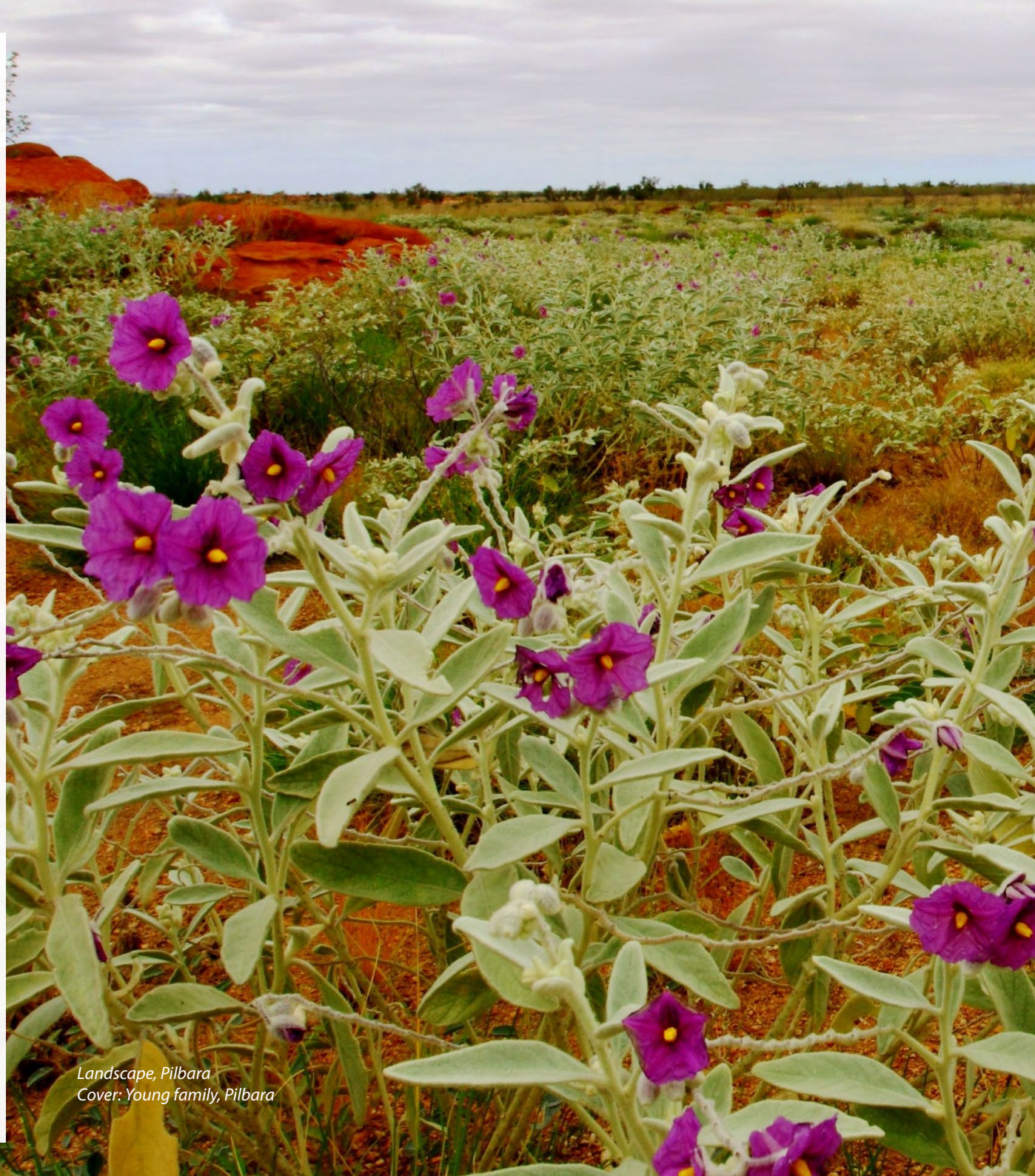
Landscape, Pilbara Cover: Young family, Pilbara