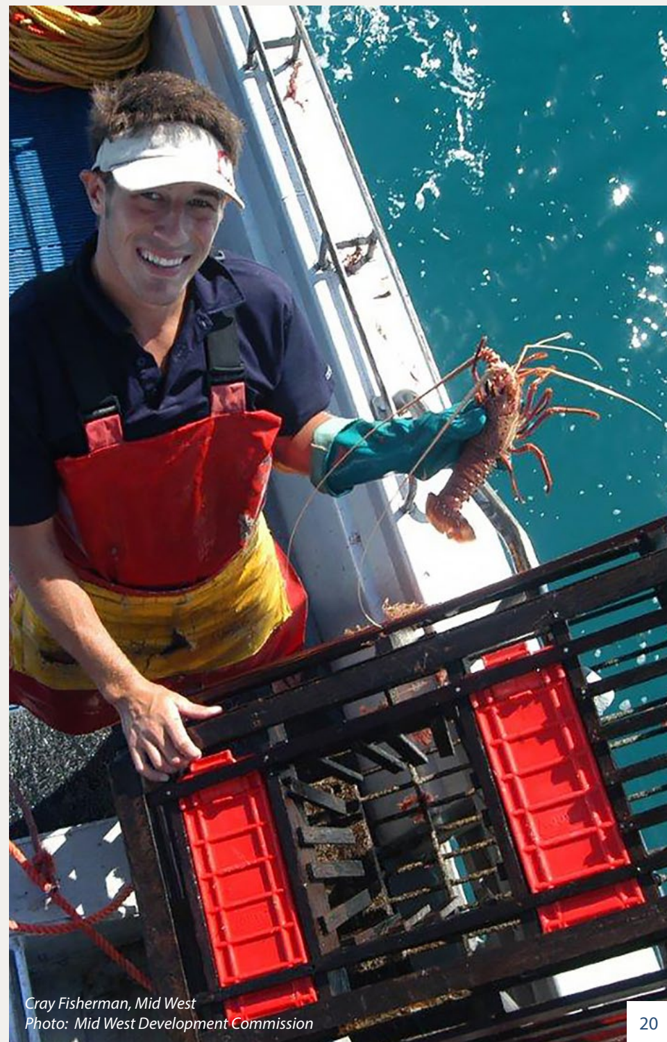
Cray Fisherman, Mid West

The Trust will report on progress in future reports.