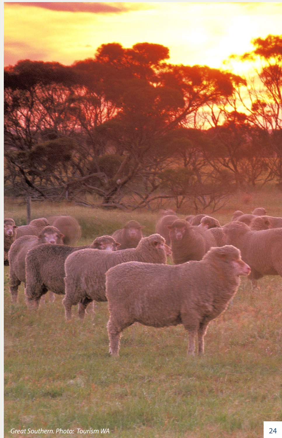
Great Southern.

The Review and recommendations were accepted by the previous Minister and the State Government. A significant amount of work was subsequently completed by DRD to implement the recommended changes. However,