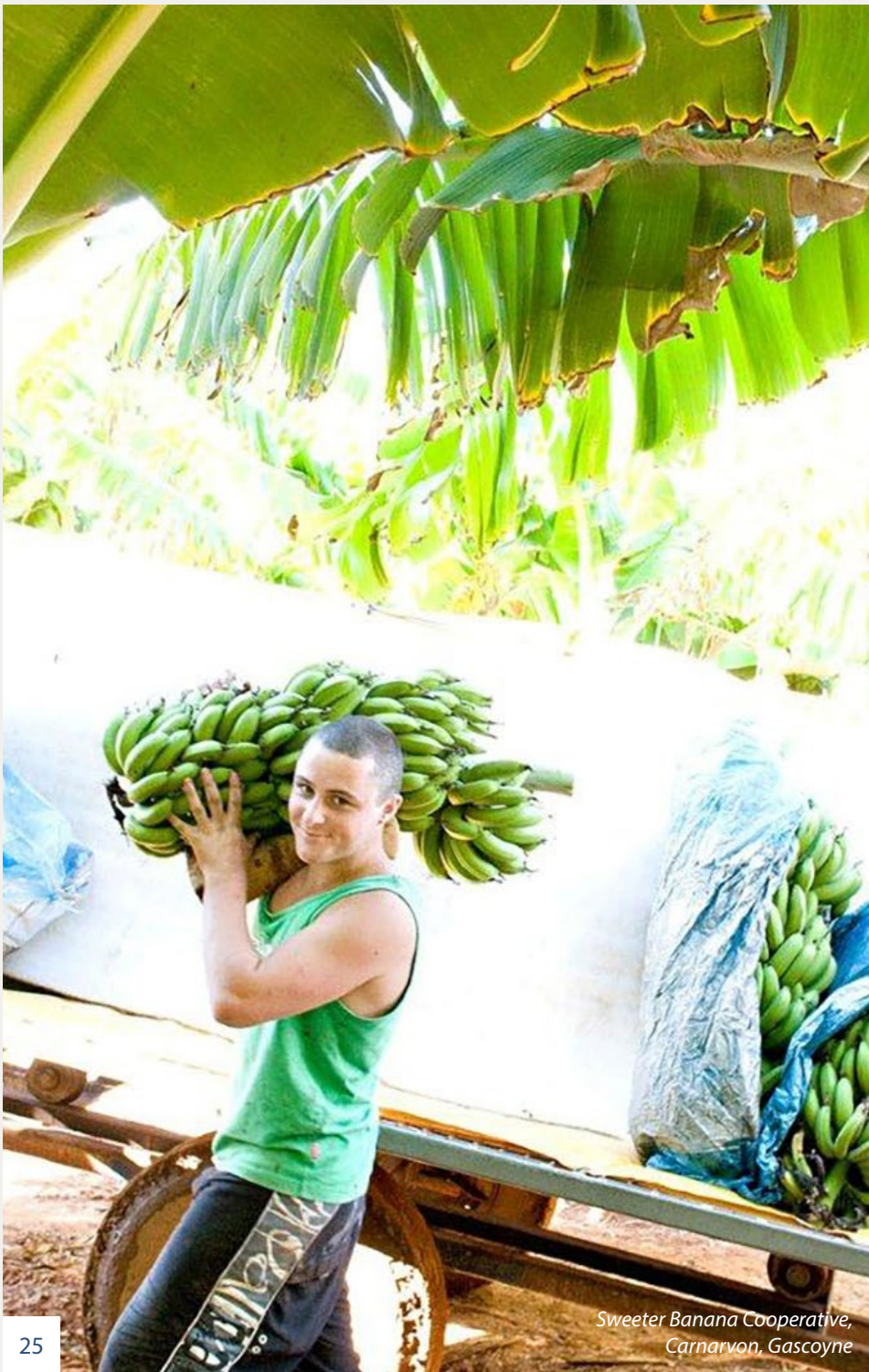
Sweeter Banana Cooperative, Carnarvon, Gascoyne

the previous Minister subsequently determined that the CLGF would not be continued in its current or revised form. The CLGF has been continued for capacity building with country local governments, completing strategic cross local government projects and funding the Regional Centres Development Plan, which will focus on strategic regional centres.