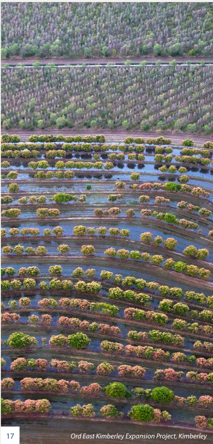
Ord East Kimberley Expansion Project, Kimberley