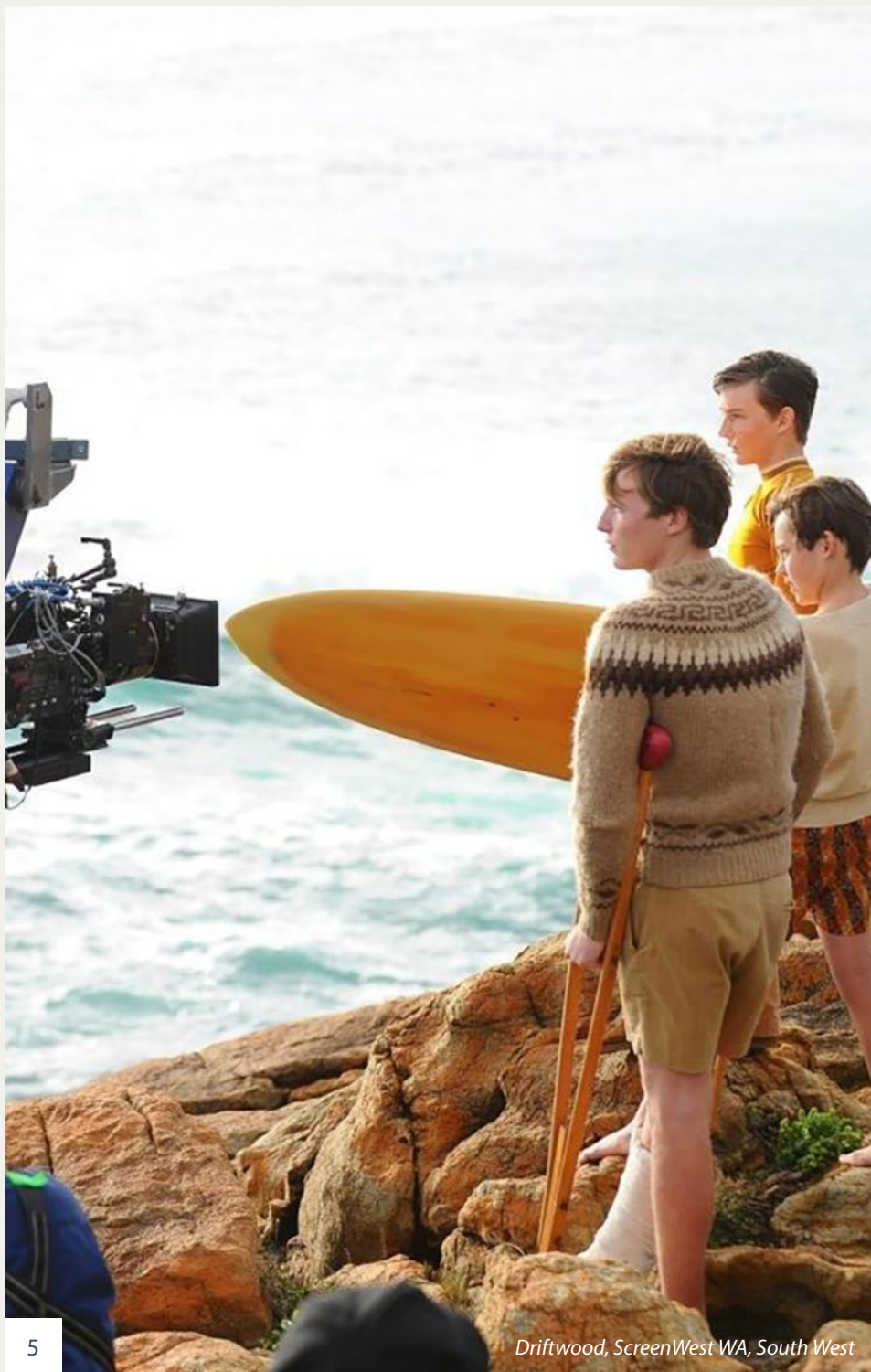
Driftwood, ScreenWest WA, South West