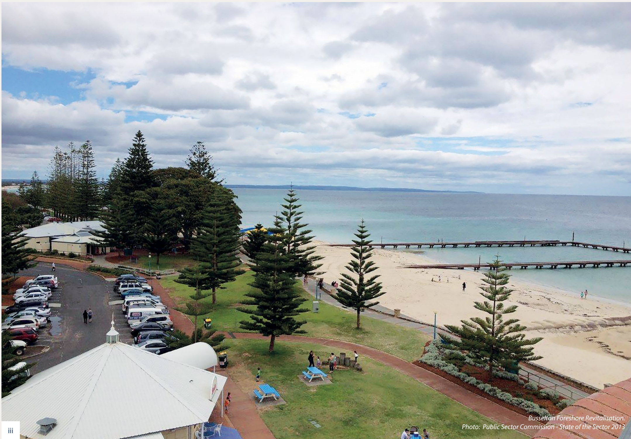
Busseton Foreshore Revitalisation.