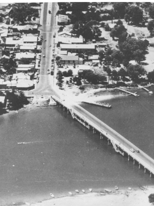
Mandurah Traffic Bridge 1953, photo courtesy City of Mandurah

Old Mandurah Traffic Bridge will be replaced after more than 60 years of service with construction expected to start in 2016.