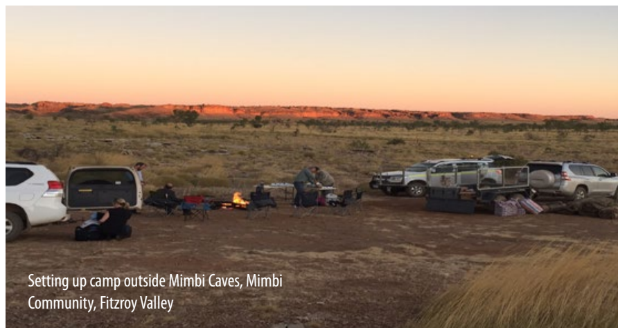
Setting up camp outside Mimbi Caves, Mimbi Community, Fitzroy Valley