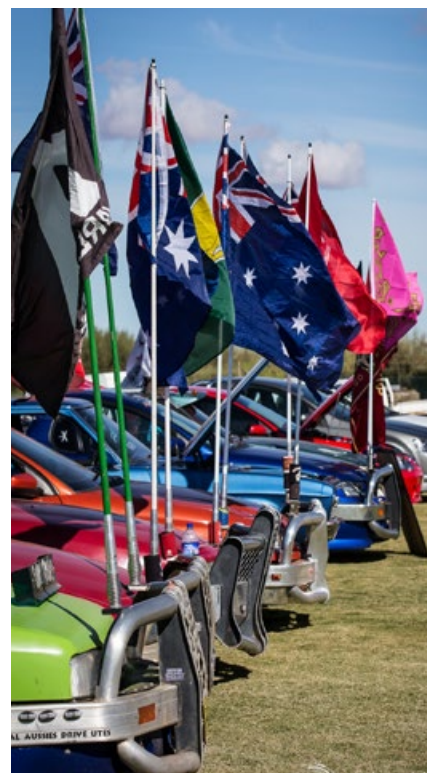
Beaut Ute entries

The Beverley Heroic is happening on Sunday 4 October 2015. ■