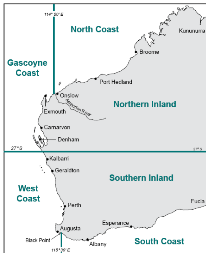
Figure 2. The Bioregions of Western Australia, defining the extent of the four marine Bioregions and the two inland Bioregions.

There are also two Inland Bioregions; Northern Inland and Southern Inland. A single commercial fishery operates within the Northern Inland Bioregion. There are no commercial wild harvest fisheries in the Southern Inland Bioregion.