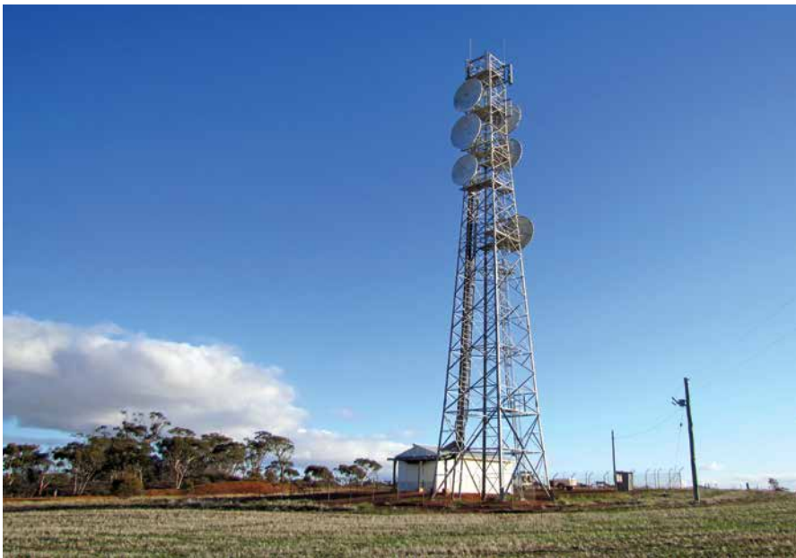
Tammin mobile tower

"This in turn enhances safety and convenience for people living in and visiting regional Western Australia and ultimately breaks down the digital divide between regional and urban areas," Ms Mackenzie said.