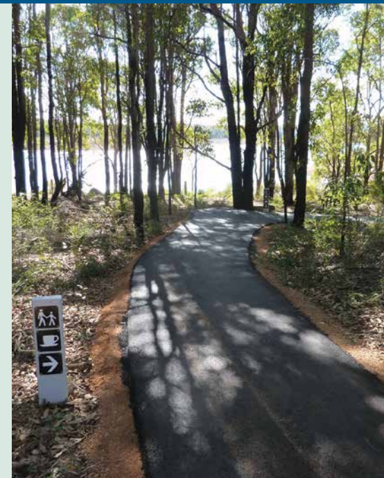
Mountain bike pump track in Logue Brook, photo courtesy of Department of Parks and Wildlife

Logue Brook recorded more than 47,000 visits in 2014-15 and is located about 10 minutes away from the town of Harvey.