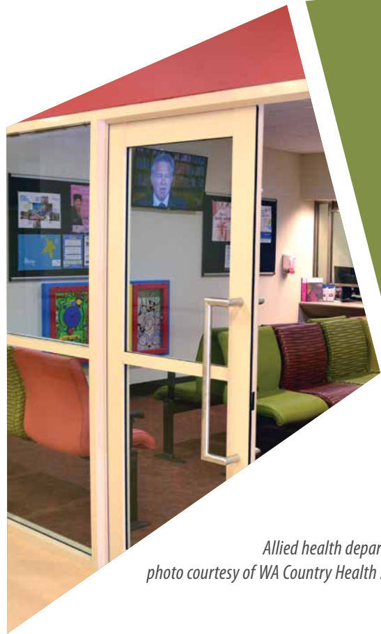
Allied health department, photo courtesy of WA Country Health Service