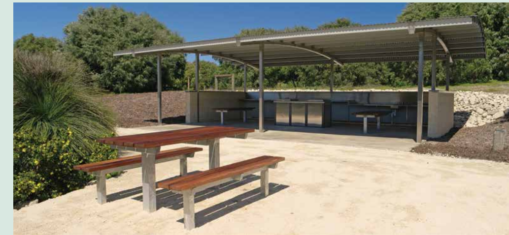
Barbecue shelter in Conto, photo courtesy of Department of Parks and Wildlife