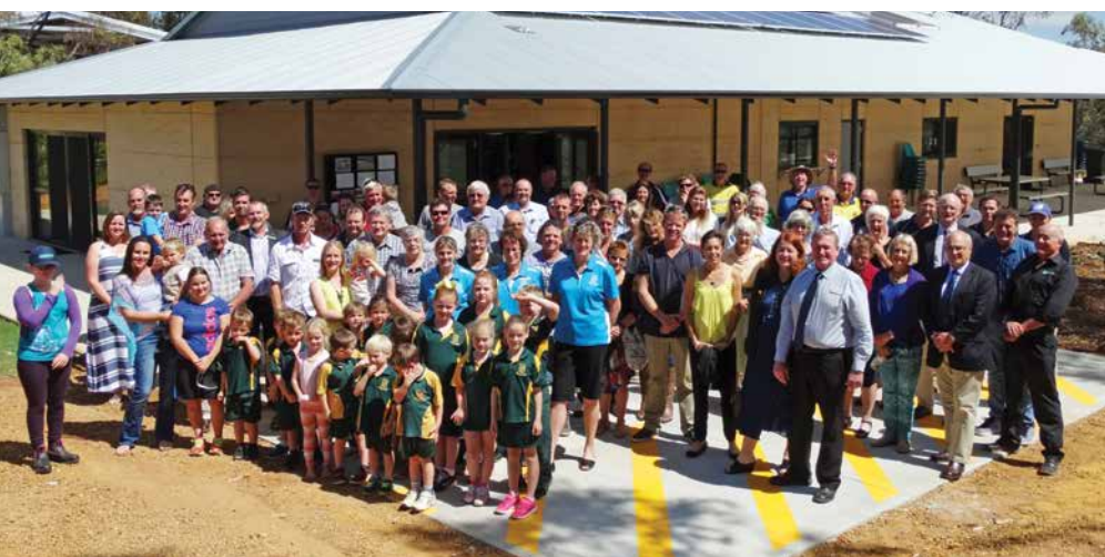
Community gather at the official opening of Yuna Multipurpose Centre

approximately $575,000 was leveraged to complete the project. An amount of $600,000 was invested for East Bowes Road through the Mid West Investment Plan administered by the Mid West Development Commission, with an additional amount of approximately $2.28 million leveraged from other Royalties for Regions, Commonwealth and Shire funding programs.