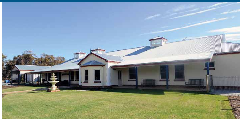
Hawthorn House in Albany.

Visit www.fightdementia.org.au for more information.