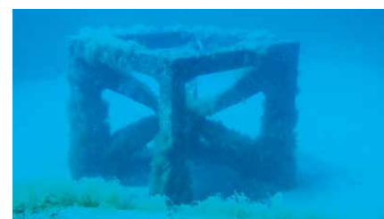
Artificial reefs module.

The project received $1.86 million from the State Government's Royalties for Regions program and $520,000 from the Recreational Fishing Initiatives Fund derived from recreational boat fishing licence revenue.