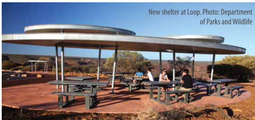
New shelter at Loop.

"The new section of road improves the safety and access for its visitors