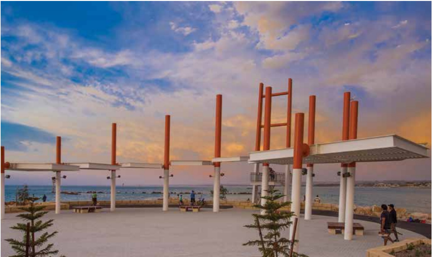
Geraldton Esplanade.

Geraldton's award winning Esplanade redevelopment has given the city's foreshore a significant facelift. The formerly isolated semi-industrial space now features barbeque facilities, shelters, landscaped walkways and a viewing tower with 360 degree views of Geraldton, the port, Champion Bay, Seal Rocks and the Moresby Ranges.