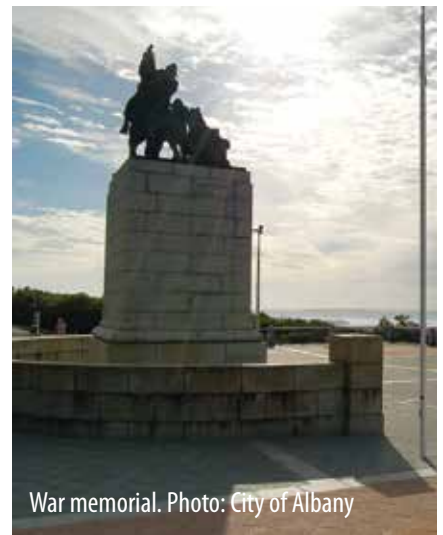
War memorial.

"The City is very grateful for the State Government's support and we're