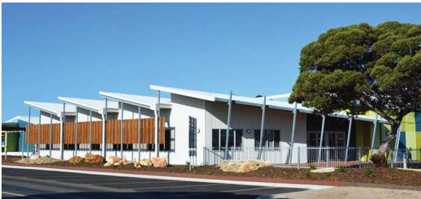
Hopetoun Community Centre's new town hall, photo courtesy of Shire of Ravensthorpe