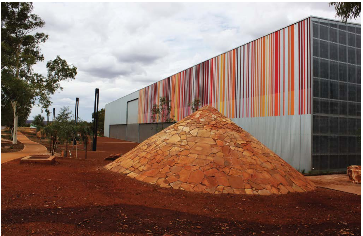
Facade of the EPAC on Newman Drive