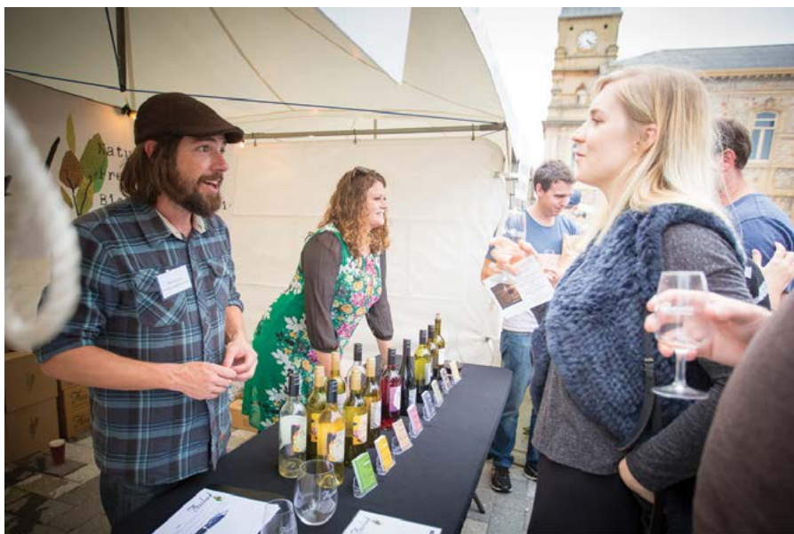
Talking food and wine at the Albany Seafood Night Markets, photo courtesy of CMS Events

For more information on funding for regional events, visit www.tourism.wa.gov.au