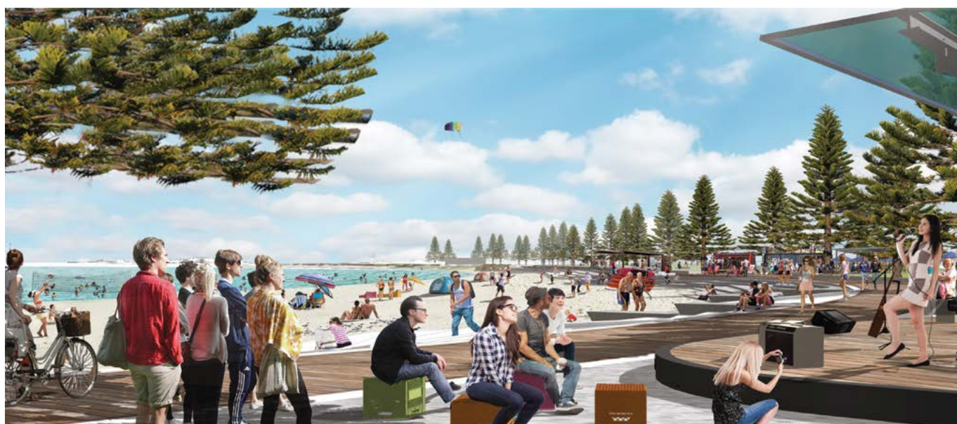
Artist impression of Koombana Bay

Royalties for Regions, through the Growing Our South initiative, will invest $600 million to revitalise the South West, Peel, Wheatbelt and Great Southern regions. For more information, visit www.swdc.wa.gov.au