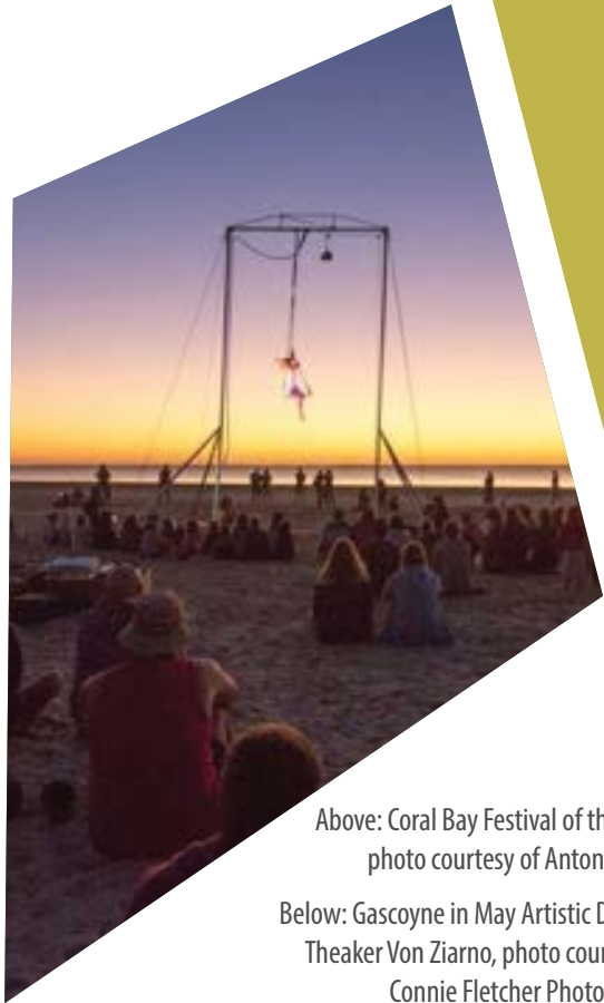
Above: Coral Bay Festival of the Reef, photo courtesy of Anton Blume