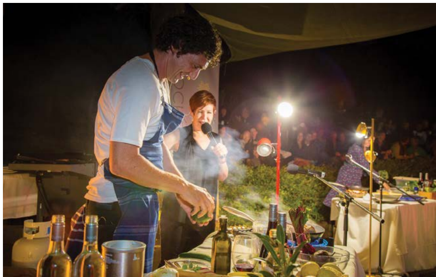
Celebrity Chef Colin Fassnidge cooks up a storm at the Rockcliffe Night Market

Held on Thursday 24 March, the picnic saw participants embark on a scenic helicopter flight to Breaksea Island where they tasted some of the region's finest beer, wine, and canapes, prepared with a focus on native Australian ingredients.