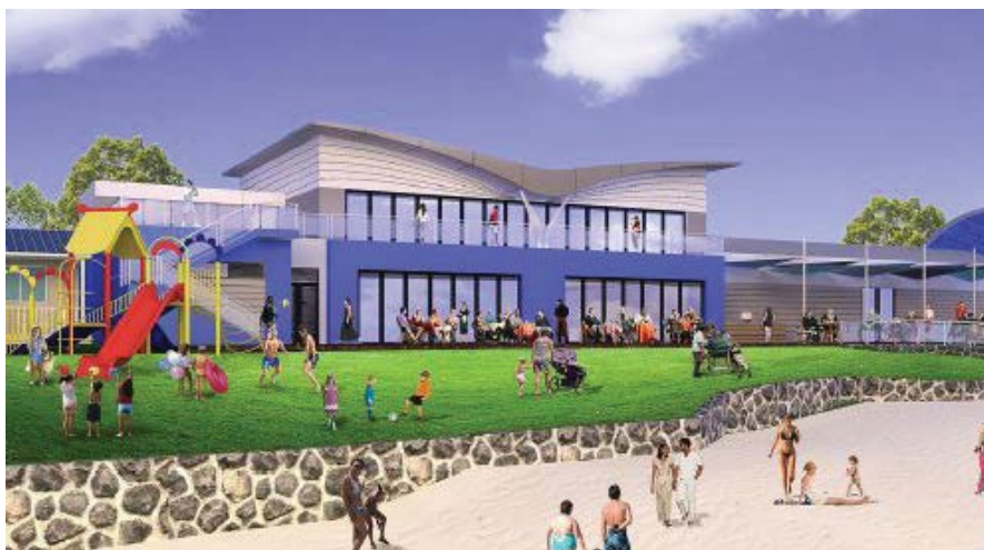
Dolphin Discovery Centre rear elevation impression by MCG Architects, image courtesy of SWDC

Bunbury's Dolphin Discovery Centre will also be redeveloped to provide new space for conference and meeting facilities, café restaurants, merchandising, and contemporary