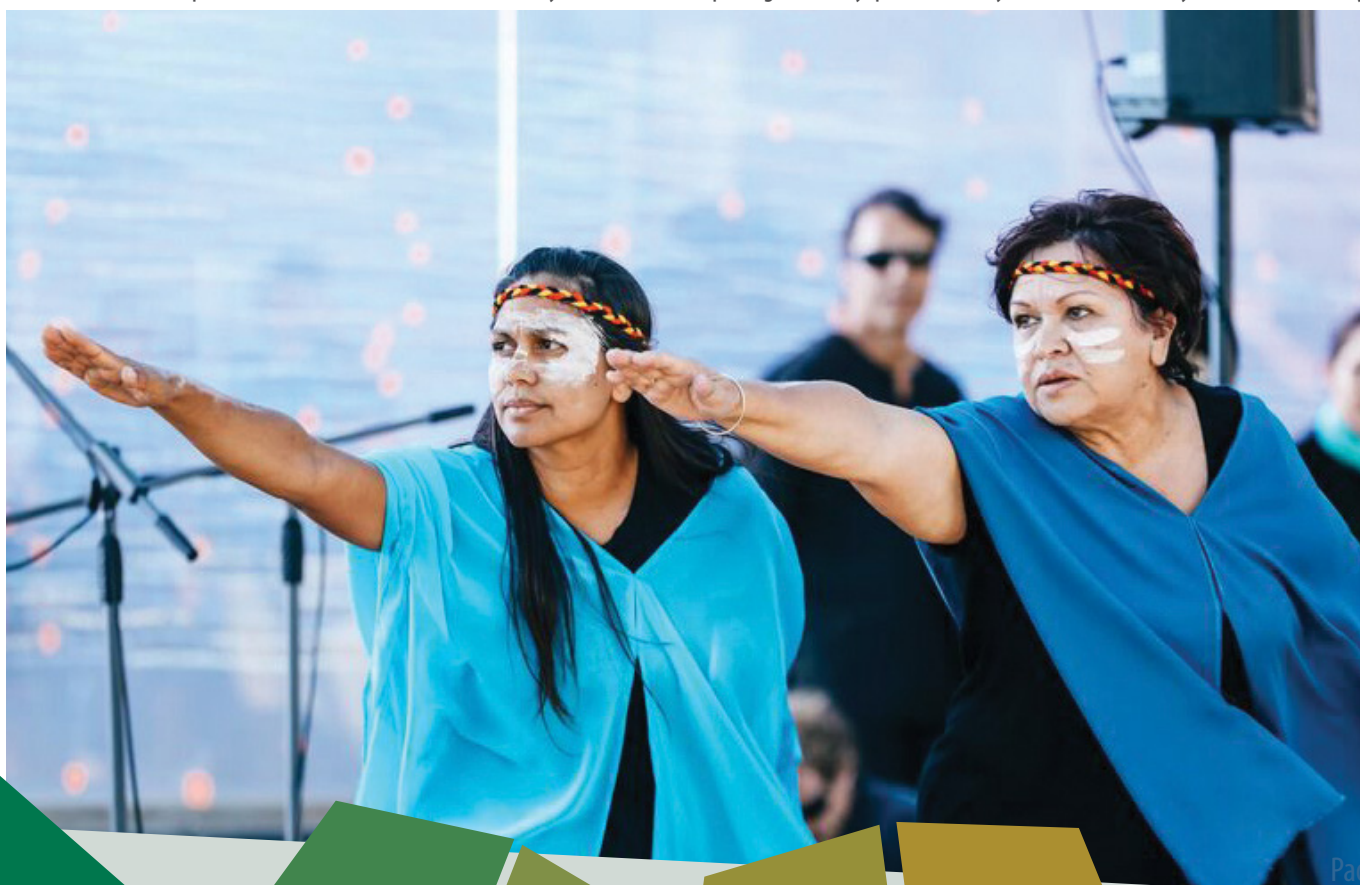
Below: Dancers perform a traditional Welcome to Country at the festival's opening ceremony, photo courtesy of Shire of Shark Bay. Credit: Elise Hassey