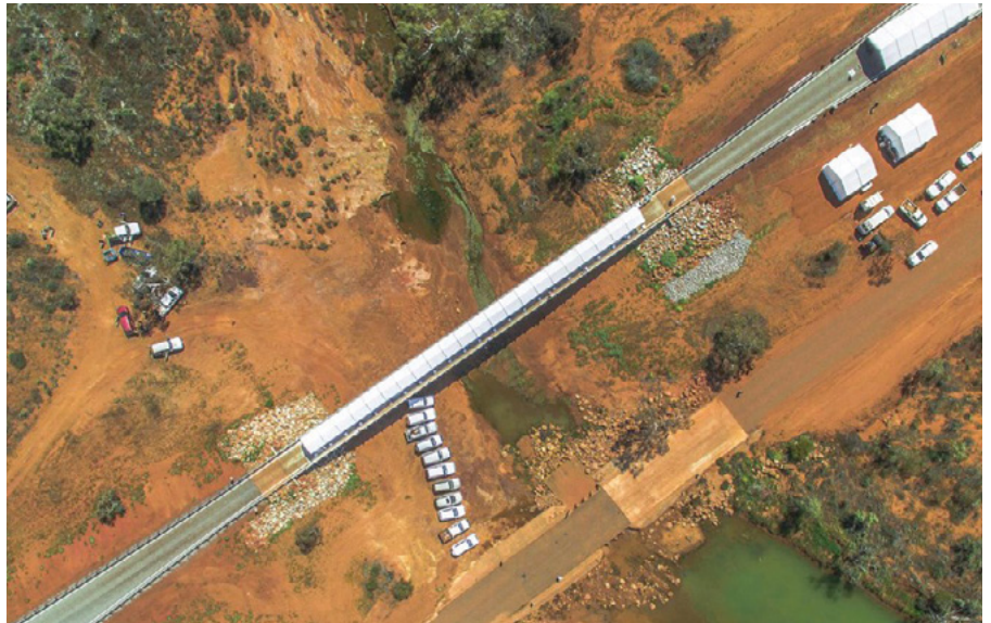
Aerial view of the new Ballinyoo Bridge