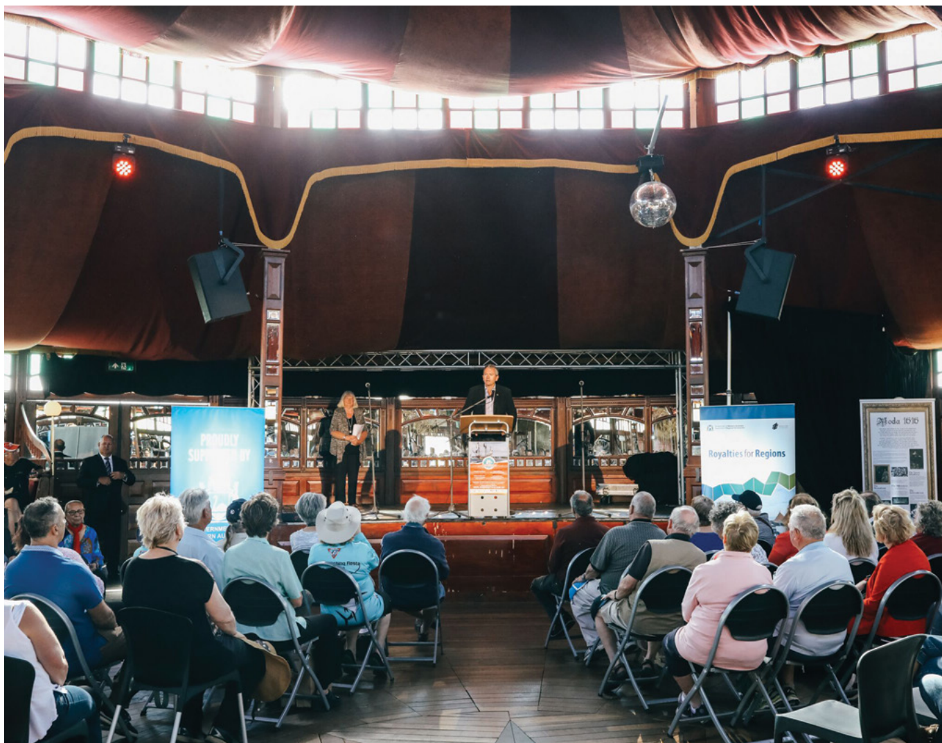
Above: Regional Development Minister Terry Redman at the festival's closing ceremony