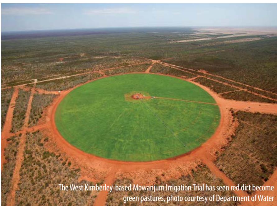
The West Kimberley-based Mowanjumb Irrigation Trial has seen red dirt become green pastures

The Department of the Premier and Cabinet's Office of Science is delivering the $3.41 million Science and Agribusiness Connect Program, which will be offering two fellowships, a tertiary program of scholarships, exchanges and work experience opportunities and an agriculture and aquaculture entrepreneurship program.