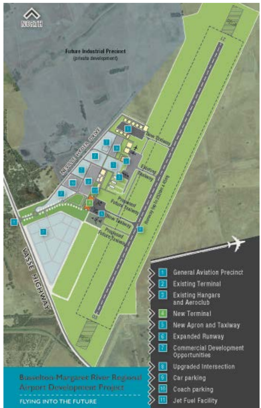
Busselton-Margaret River Regional Airport Masterplan

Expansion of the Busselton-Margaret River Regional Airport began in 2015 and will be completed in 2018.