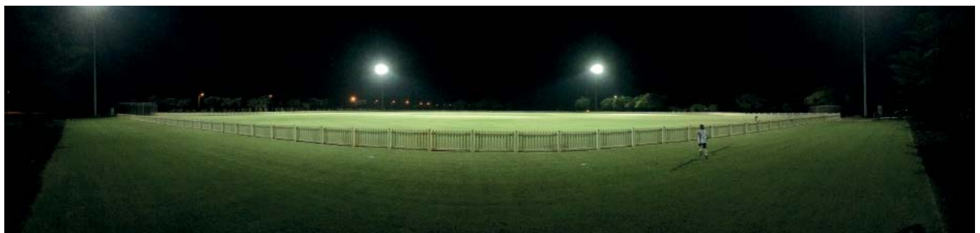
Barnard Park by night, photo courtesy of City of Busselton

To access more information and keep up to date on the progress of the Busselton Foreshore Redevelopment project, visit www.busselton.wa.gov.au