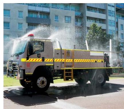
External water deluge system in action

The $15.4 million project includes a $12.3 million investment over three years through the State Government's Royalties for Regions program to provide crew protection equipment on 667 appliances in regional Western Australia. Altogether the crew protection equipment will be installed on nearly 1,000 DFES and Local