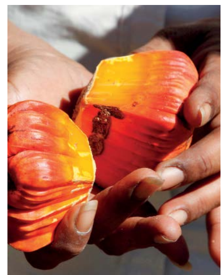
Pandanus fruit found in northern Australia, photo courtesy of WAITOC