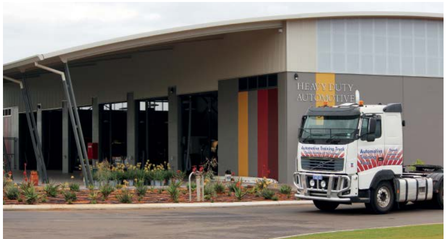
Durack Technology Park

The facility, made possible by a $9 million investment through the State Government's Royalties for Regions program, includes equipment that provides students with access to specialised training in areas such as advanced diagnostics, emissions testing and advanced electronics.