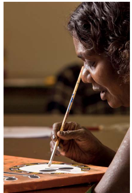
Aboriginal Artist in the Kimberley

"I look forward to seeing these 17 businesses contribute to the improved quality and authenticity of Aboriginal tourism products."