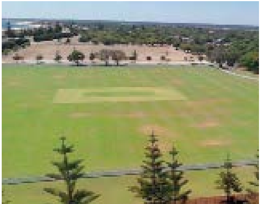
Barnard Park aerial

"Our main aim was to lock down a prime location for a unique sporting field for the community to enjoy now and into the future, and we definitely succeeded.