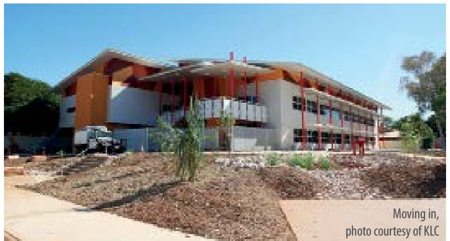
Moving in, photo courtesy of KLC