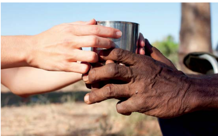
Sharing culture around the campfire, photo courtesy of WAITOC

The Aboriginal Tourism Development Program is made possible by a $4.6 million investment from the State Government's Royalties for Regions program and is administered by Tourism WA and WAITOC.