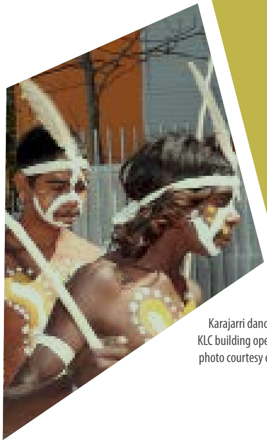
Karajarri dancers at KLC building opening

First established in 1978, the KLC is the peak Indigenous body in the Kimberley region, working with Aboriginal people to secure native title recognition,