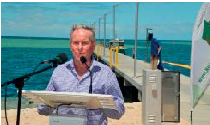
Premier Colin Barnett opening the jetty

one of a number of projects being delivered through the Royalties for Regions Gascoyne Revitalisation Program. The HMAS Sydney Memorial in the forecourt of the Shark Bay World Heritage Discovery and Visitor Centre, Shark Bay Community Centre and Monkey Mia Jetty Replacement are also part of the revitalisation.