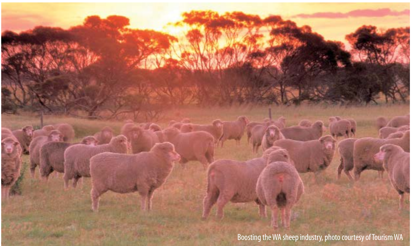
Boosting the WA sheep industry

By enhancing the agricultural sector, Seizing the Opportunity Agriculture is supporting the creation of new jobs, improved income and better prospects for Western Australian businesses and regional communities.