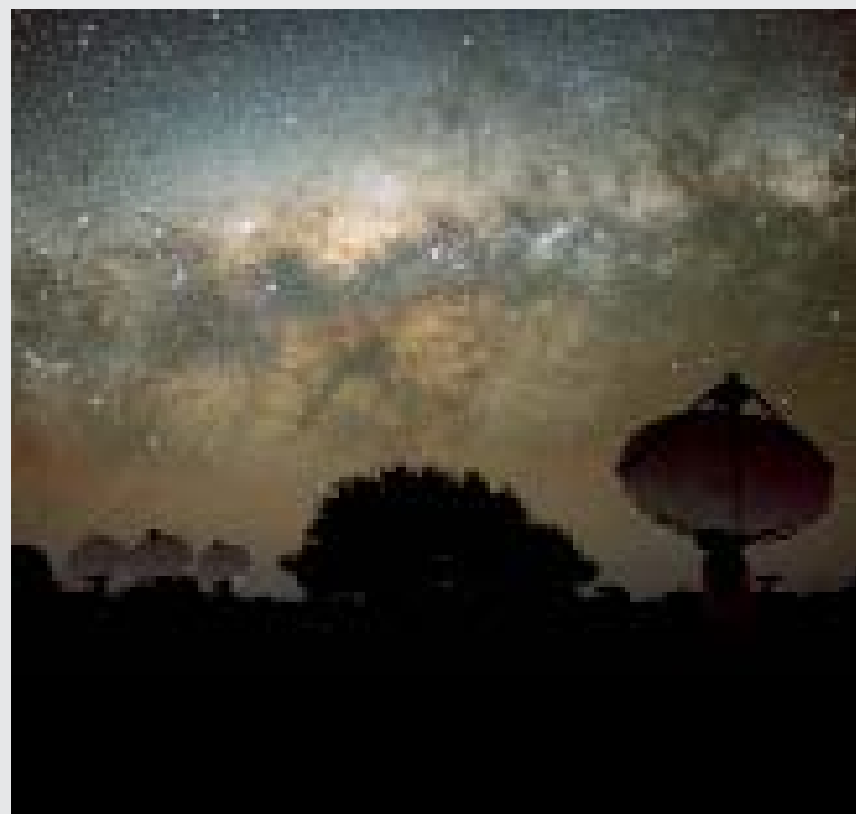
ASKAP dishes silhouetted against the Milky Way

For more information on the SKA project visit www.ska.gov.au