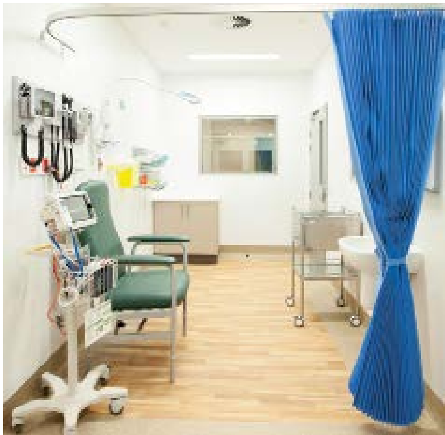
New treatment room

The two state-of-the-art resuscitation bays are equipped