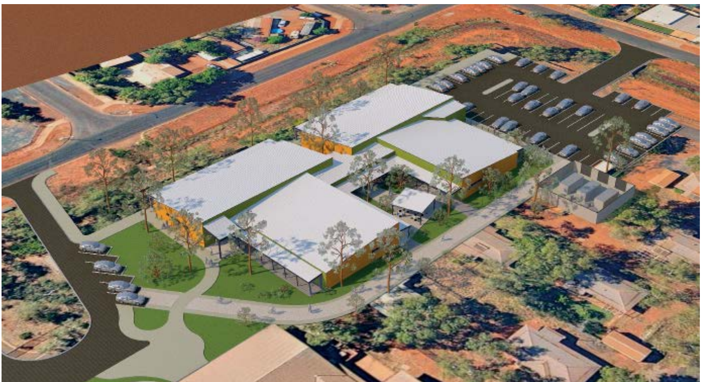
Artist impression of South Hedland facility

The $15.7 million centre will offer a modern health training facility that caters for the training needs of the local population and assists in upskilling health sector workers.