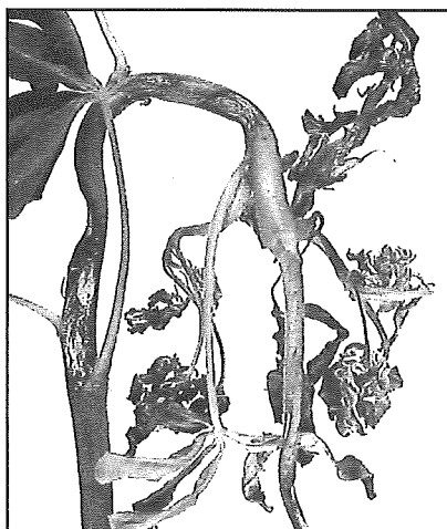
Above: Anthracnose infection on albus lupin stem.

A letter has gone out from Agriculture Western Australia to those growers holding Albus lupin seed (Kiev) stating that the lupin industry has endorsed a return to commercial production of Albus lupin in 1999 and inviting them to plant Kiev lupins for bulk up in 1998.